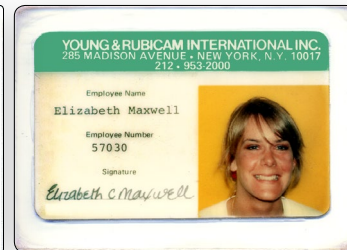
Young & Rubicam Art Director