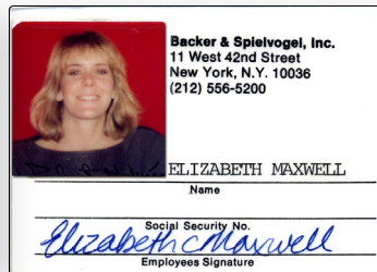
Backer & Spielvogel Senior Art Director, VP