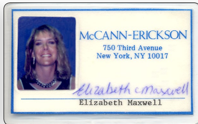
McCann Erikson Creative Supervisor, VP